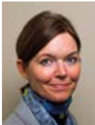
Lise Kingo Executive Director United Nations Global Compact

In September 2015, world leaders adopt the 2030 Agenda for Sustainable Development including 17 sustainable development goals (SDGs) to accelerate transformative change needed to lead our world to a more sustainable future. This ambitious action agenda calls for a renewed global partnership to address urgent global sustainable development challenges such as ending poverty, tackling inequality, protecting the planet and women and girls' empowerment. Because no single actor can realize ambitious SDGs, the 2030 Agenda emphasizes the active engagement of all key players on issues of common importance.